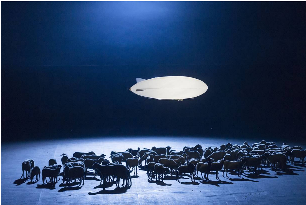
Scene from Part III, De Materie

Absence , the first collection of his writings translated into English, makes a significant contribution to shifting the margins and the centre of the discourse on practice.