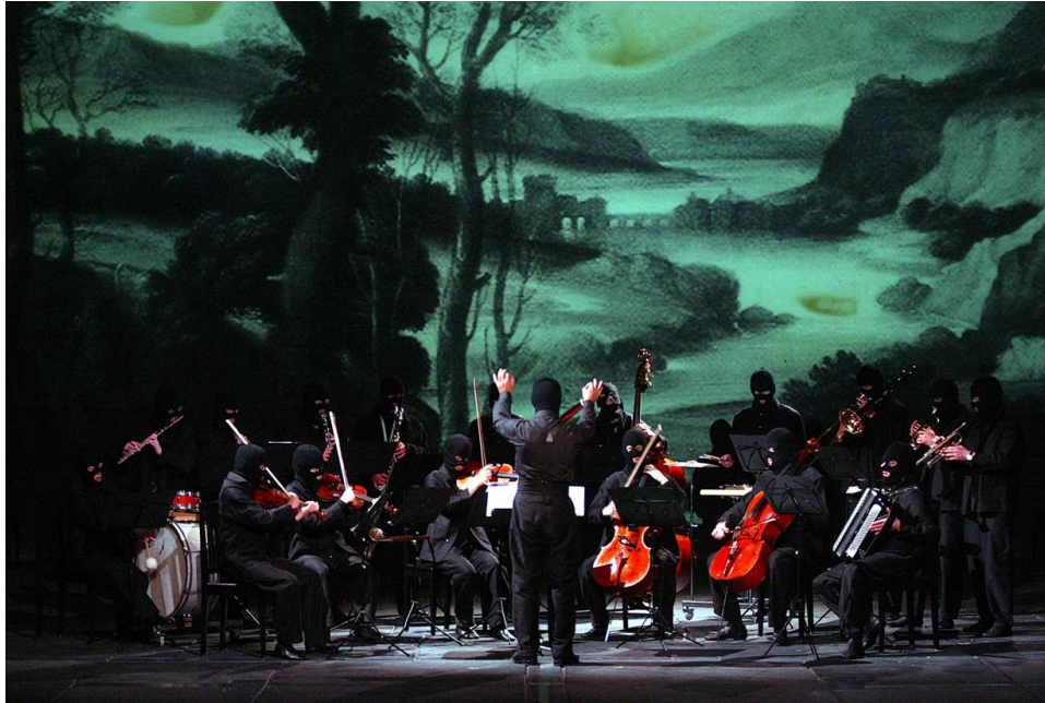
Ensemble Modern, clad in balaclavas, in Landscape With Distant Relatives

He celebrates the organisation of Ensemble Modern, his long-time collaborators, in their practices of self-administration off-stage that reflect on-stage in their collective responsibility and openness to the new (in contrast to the ‘hierarchical and alienated conditions of [orchestral] hired musicians’). 22 Perhaps most radically, he presents the act of composition as the creation of a method of production adequate to the people with whom he collaborates. In order to experience the not-yet-known, the artist must play a role immanent to the culture within which that experience will be produced.