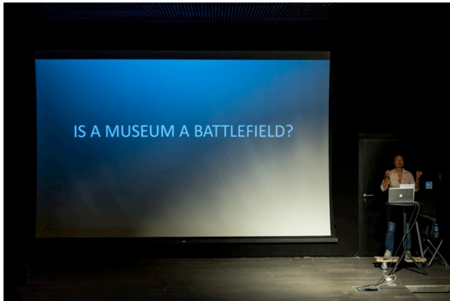
Hito Steyerl, Is a museum a battlefield? , 2013, video documentation of a nonacademic lecture, approximately forty minutes, courtesy the Public Programme at the Stedelijk Museum, Amsterdam, photo: Servet Dilber

that articulate them in specifically artistic terms, drawing on resources such as allegory, symbolic displacement, ambiguity and indeed self-reflexivity – resources that are proper to artistic practice. So the withdrawal may not be such a loss after all. On the evidence of this biennial, the most potent way for artists to support a protest is to work with their own means in parallel to it.