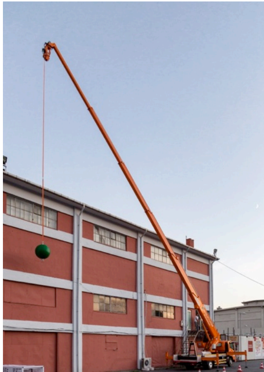
Ayşe Erkmen, bangbangbang, 2013, courtesy Galerie Barbara Weiss, Berlin, and Galeri Manâ, Istanbul

on the site of the warehouse will in time also be replaced. And inasmuch as the buoy is upside down, suspended from a crane rather than anchored to the seabed, the work may be read as hinting that property development in Tophane and elsewhere in Istanbul follows a logic that stands in an inverse relation to the needs of local communities; certainly, that logic is in turn inverted in the harmlessness of the buoy. Acting as a curtain raiser for the biennial, the work is both a compelling exercise in site-specificity and a clear curatorial statement of intent.