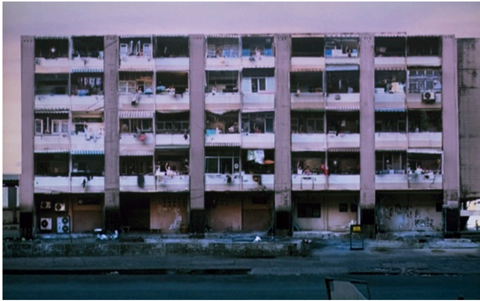
Bertille Bak, Safeguard Emergency Light System , 2010, video, seven minutes, courtesy Nettie Horn, London, and the artist, photo: Servet Dilber

Bertille Bak's short film Safeguard Emergency Light System (2010) is another pivotal work, serving like Altindere's video to link the politics of urban renewal with the aesthetics of protest. It shows the residents of a condemned housing complex in the Din Daeng neighbourhood of Bangkok as they learn to play a revolutionary song, the score of which has been transcribed for flashlights, in protest against their eviction and the failure of the local authorities to compensate or re-house them. The film culminates in a 'concert' in which the mostly female residents stand on their balconies in the fading light and intermittently flash their torches in a tightly co-ordinated and affecting performance that points in its silence to the indifference of the authorities but also demonstrates the residents' anger and commonality.