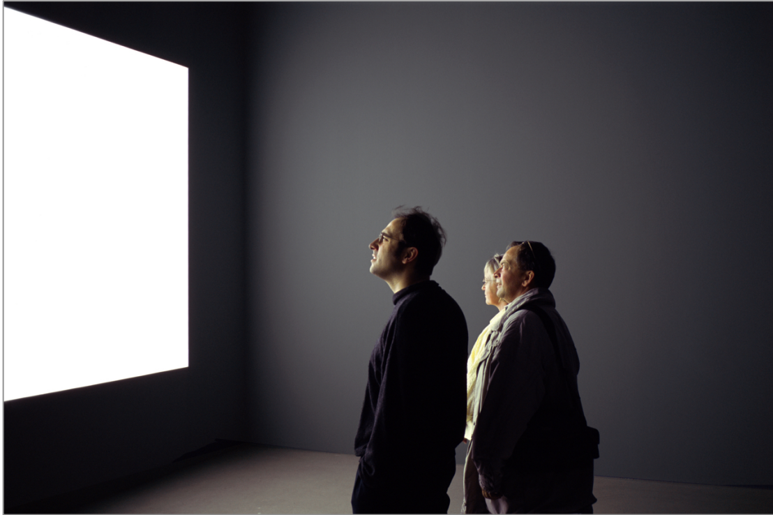
Alfredo Jaar, Lament of the Images , 2002, courtesy of Galerie Lelong & Co, New York, Louisiana Museum of Modern Art, Humlebæk, Museum of Modern Art, New York, and the artist

is precisely to exercise that important rescue movement: keeping the contemporary safe from linearity. Linearity, with its arrogant implications of progress and the contempt for earlier achievements, is not, as it tends to be seen, the primary tool of historical thinking. This book is not a- or anti-historical. Resolutely probing what the present and its different presences mean and make, Lund manages here to think historically outside of the linearity fallacy.