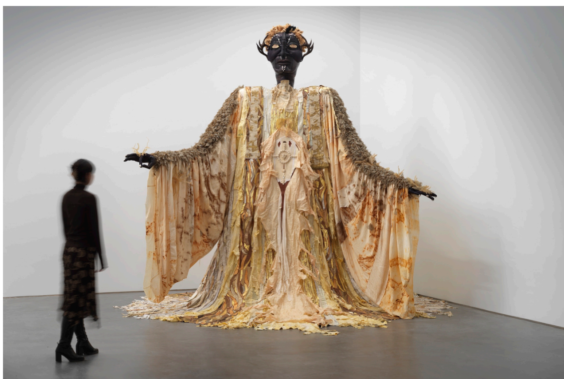
Tau Lewis, The Handle of the Axe , 2024, installation view in 'New Humans: Memories of the Future', 2026, New Museum, New York

'New Humans: Memories of the Future', New Museum, New York, 21 March 2026 – ongoing