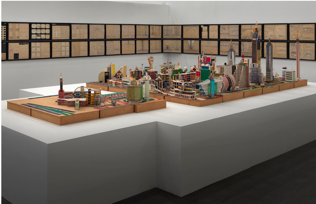
Foreground: Bodys Isek Kingelez, Ville fantôme , 1996; back wall: Hariton Pushwagner, drawings from Soft City , 1969–75; installation view in ‘New Humans: Memories of the Future’, 2026, New Museum, New York, courtesy of the New Museum, photo by Dario Lasagni

But it is these very things that make it exciting. This is not the kind of exhibition where one is easily led from section to section; it is an opportunity to get lost. In its attempt to link the last century’s modernism with the present, ‘New Humans: Memories of the Future’ is as messy as our understanding of ourselves and our histories. It demands multiple visits. And the New Museum must know that, because, as of this writing, neither the catalogue nor any of the press materials have given the exhibition an end date.