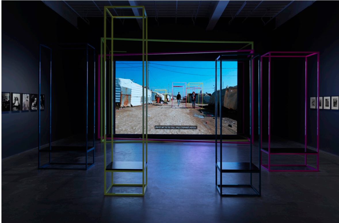
Hito Steyerl, Mechanical Kurds , 2025, installation view in 'New Humans: Memories of the Future', 2026, New Museum, New York, courtesy of the artist and the New Museum, photo by Dario Lasagni